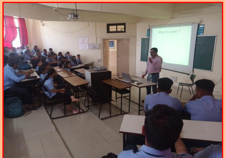
GUEST LECTURE ON CAREER OPPORTUNITIES AFTER DIPLOMA