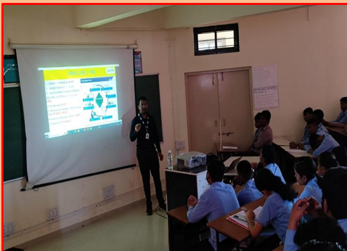
GUEST LECTURE ON AWARENESS ABOUT SAP & MATERIAL MANAGEMENT ERP SOFTWARE