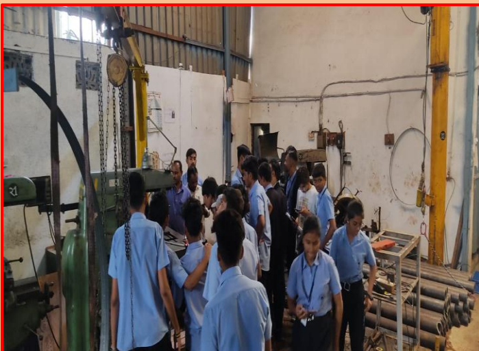
Industrial Visit at Rahul Industries

Place of Visit: Rahul Industries, Bhosari