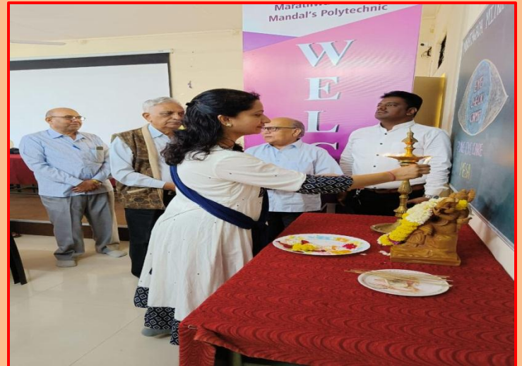
BLOOD DONATION AND EYE CHECK UP CAMP INAGURATED BY HON. MANAGEMENT MEMBERS, PRINCIPAL MADAM