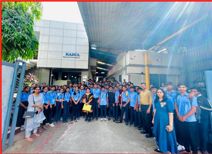
Industrial Visit at Rahul Industries

Place of Visit: Rahul Industries, Bhosari