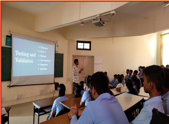
GUEST LECTURE ON PRODUCT DESIGN & DEVELOPMENT