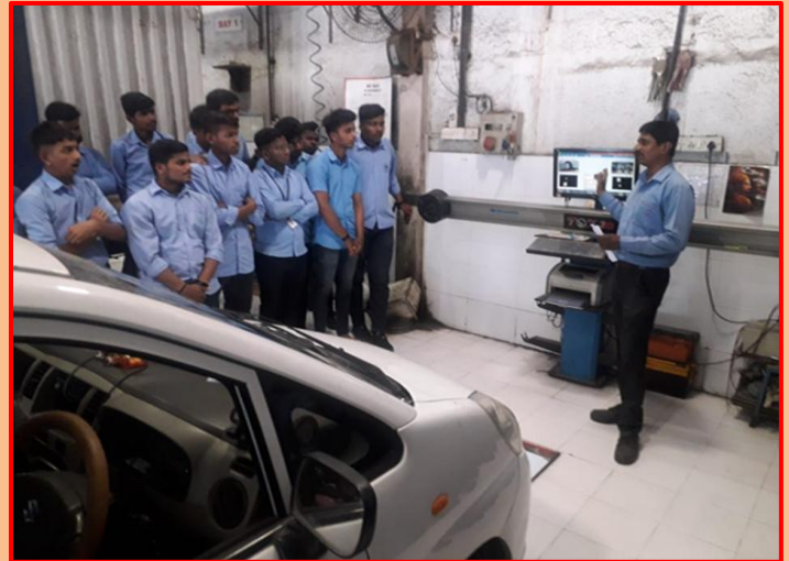
Industrial Visit at ACE Kudale Car Pvt. Ltd.

Place of Visit: ACE Kudale Car Pvt. Ltd. Bhosari