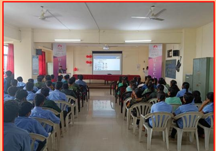
GUEST LECTURE ON CAREER OPPORTUNITIES IN PLANT ENGINEERING