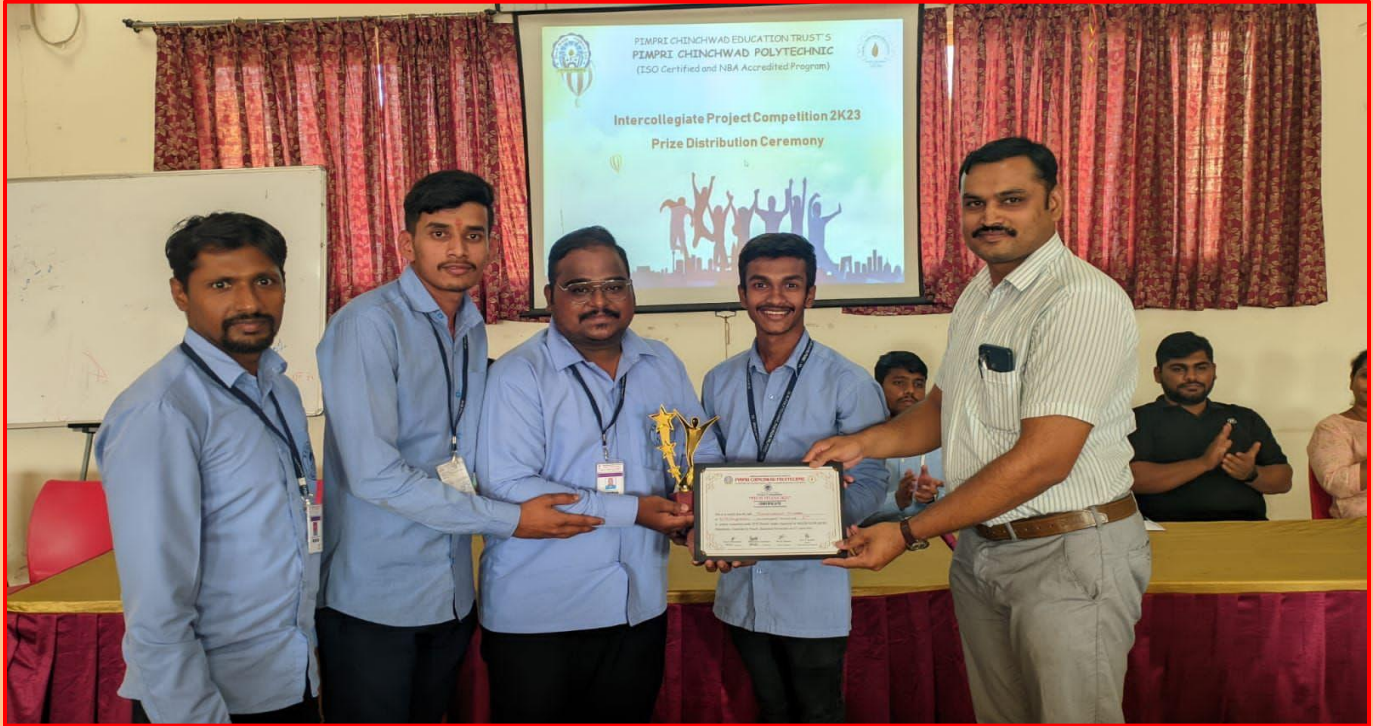
HEARTY CONGRATULATIONS TO SECURE A SECOND RANK IN PROJECT COMPETITION HELD AT PIMPRI CHINCHWAD POLYTECHNIC, PUNE ON DATED 21 ST APRIL 2023