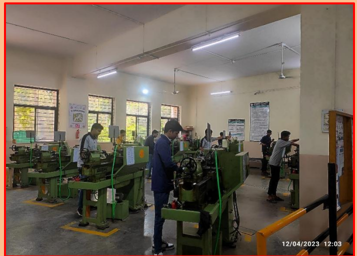
AVANT 2K23- LATHE WAR HELD ON 12 TH APRIL 2023