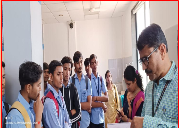
Industrial Visit at Water Treatment Plant

Place of Visit: Water Treatment Plant, Nigdi