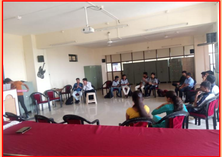
AVANT 2K23- TECHNICAL QUIZ COMETITION HELD ON 12 TH APRIL 2023